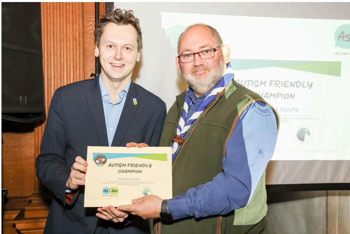
Howth Sea Scouts

But our approach has not been confined to just sports clubs and organisations. We have also worked very closely with some iconic organisations who are key members of our community, such as Howth Tidy Towns who completed their training in June 2025 and have since been extremely active in their follow-up, creating visual guides for those volunteering to assist with their very valuable work in keeping Howth clean and green, as well as Howth Creative Writing Workshops who do a great job in encouraging local residents to explore and develop their writing skills.